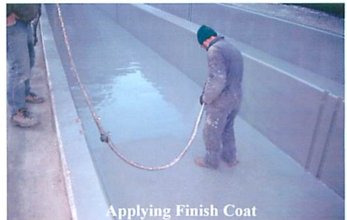
Applying Finish Coat