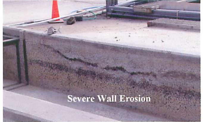
Severe Wall Erosion

The smooth, even surfaces will minimize injury to the fish and make for easier cleanup of the raceways for many years to come.