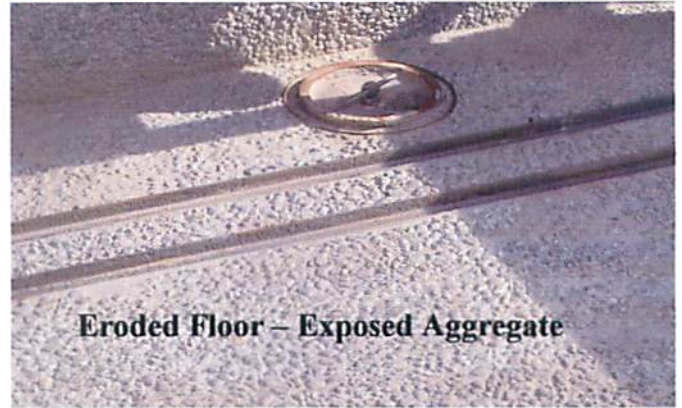
Eroded Floor – Exposed Aggregate